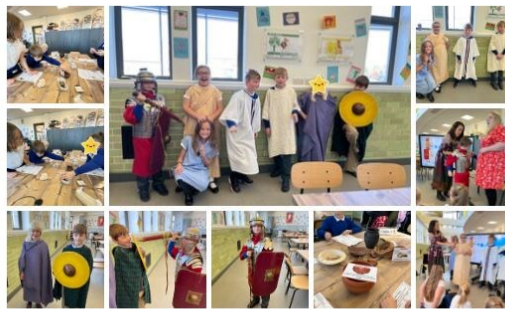
Danum Gallery, Library & Museum Trip

able to find out about how the Romans influenced Britain and Doncaster. They dressed up in Roman attire and were able to hold extremely old artifacts from the Roman era. It was a great day out and was enjoyed by everyone.