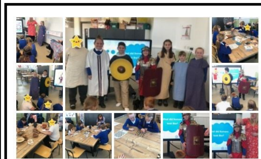
Danum Gallery, Library & Museum Trip

Our Year 5 pupils enjoyed a trip to Danum Gallery, Library & Museum in Doncaster. They were able to explore the art gallery, museum and train heritage centre, as well as